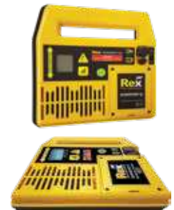
Slim, Sleek & Powerful Transmitter 3.5 lbs and 1.75" thick